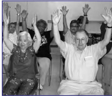
Isaacs in Motion seniors enjoy yoga class — a great way to add exercise and relaxation into their day!