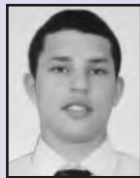
Anthony Santiago Henry & Lucy Moses Scholarship Hunter College